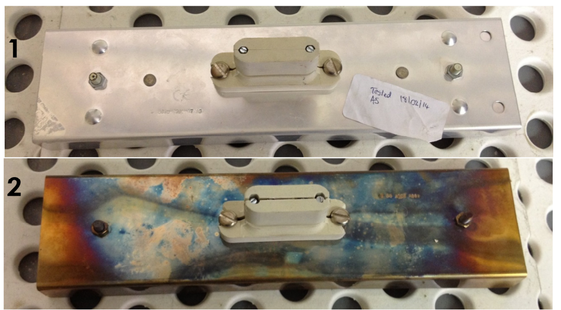
Figure 2: Comparison of aluminised steel (1) and stainless steel (2) after testing.